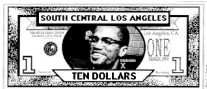
Figure 1: examples of complementary currency notes. From top: An Eighth-Hour note from Ithaca, New York State USA; Ten Toronto Dollars, from Canada; and Ten Dollars from South Central Los Angeles.

The complementary currencies examined here are designed for specific aims concerning social, economic and environmental aspects of sustainable development, and in particular the need to transform the consumption patterns of individuals, households and communities. The following section introduces two distinct types of complementary currency which are in use in the UK today (time banks and local money), and describes their origins and characteristics. It then proceeds according to the criteria of sustainable consumption set out above, and highlights where these complementary currencies are attempting to make a difference to the financial infrastructure of society, and the implications of those changes for low-carbon communities.