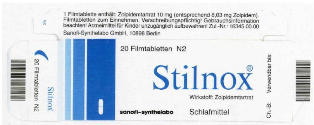
Figure 2: Figure of the original drug package of Stilnox produced by Sanofi-Synthelabo .