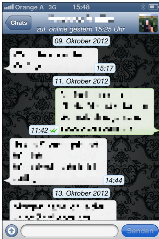
Figure 2: Message history in the WhatsApp Messenger app

Apart from the network operator's charges for using the internet, the messages are sent for free. iPhone users are currently charged a one-time fee of EUR 0.89 for downloading the app. 18 For the users of other operating systems, the software is free for the first year and can be used thereafter for an annual subscription of USD 0.99. 19