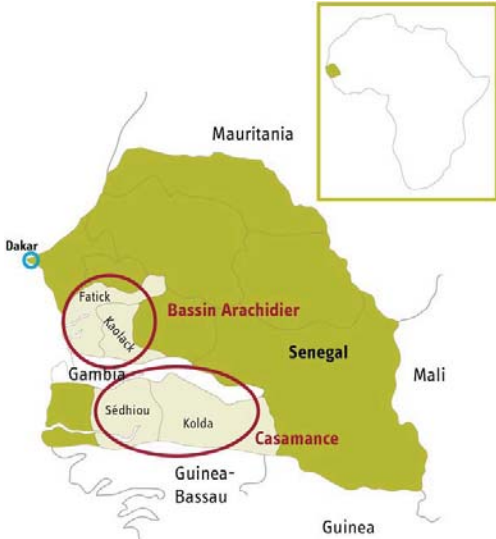
Figure 1: ERSEN intervention areas

ERSEN has two target regions: the Bassin Arachidier and the Casamance (see Figure 1). The analysis in this paper is restricted to SHS dissemination in the Casamance region. Concerning the geographical conditions, the Casamance is largely separated from the rest of the country by The Gambia and the homonymous Casamance River. This isolation led to both political and economic marginalization. In addition, the