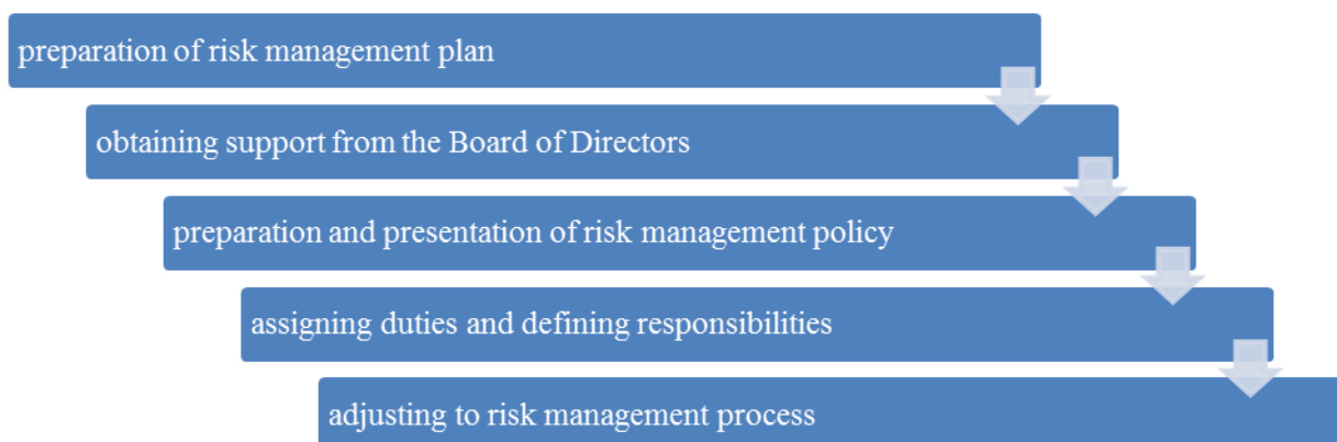
Figure 2: Implementation program of risk management system