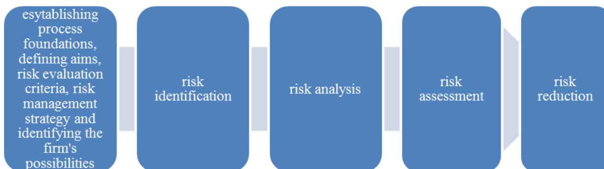
Figure 3: Risk management process with use of general standards