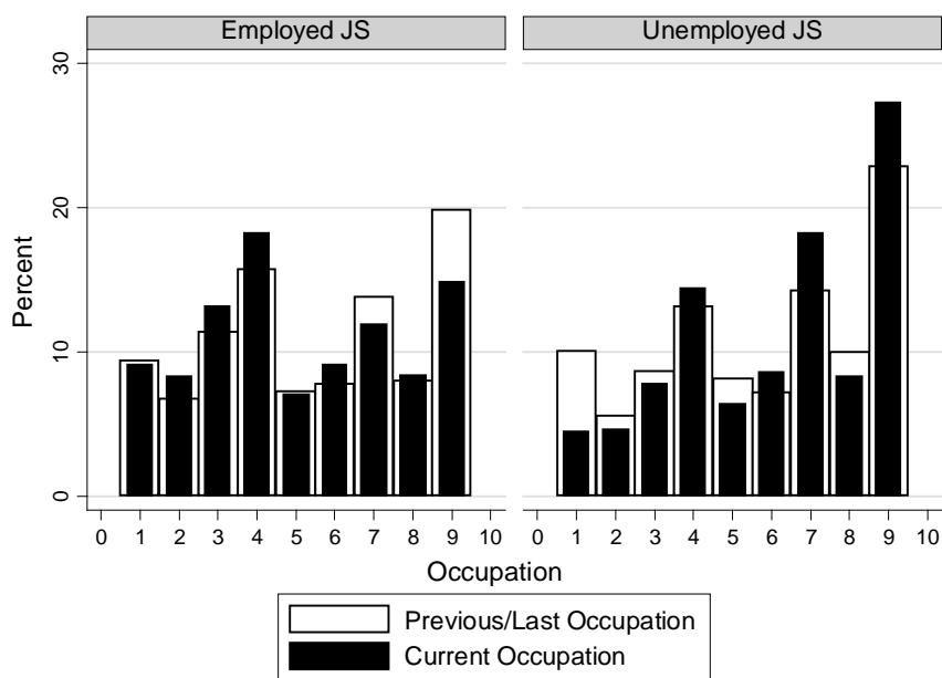
Graphs by whether was employed or unemployed job seeker

Legend: 1 managers and senior officials; 2 professional occupations; 3 associate professional and technical; 4 administrative and secretarial; 5 skilled trades occupations; 6 personal service occupations; 7 sales and customer service occupations; 8 process, plant and machine operatives; 9 elementary occupations