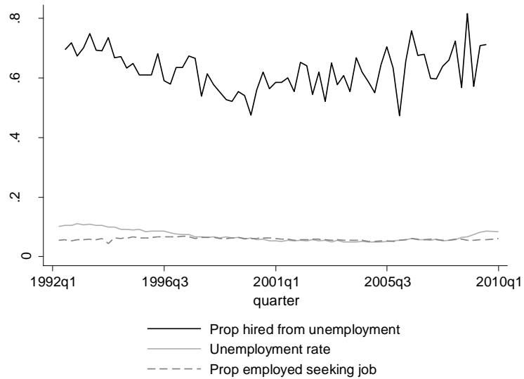
Figure 2: Proportion of employed and unemployed job seekers finding a job