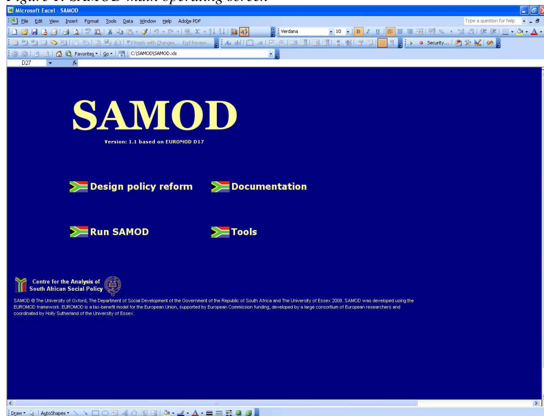
Figure 1: SAMOD main operating screen

Although the design of the model can be easily adapted to a single country there are some EUROMOD features which are unnecessary in the case of a single country but which cannot be removed, for example, parameters relating to exchange rates. In addition, it is not currently possible to remove all country-specific variables from EUROMOD which results in a number of ‘unnecessary variables’ remaining in the model.