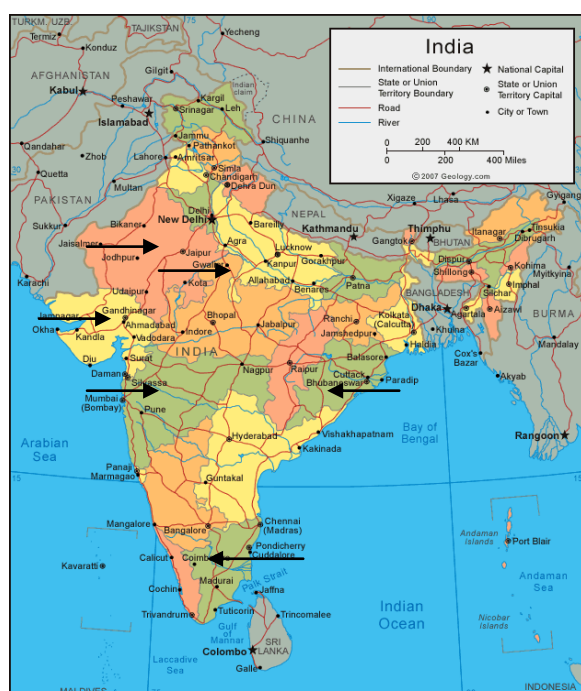
Figure 1: FINISH project Area (as of April 2009)

Figure 1 below shows the FINISH project area as of April 2009.