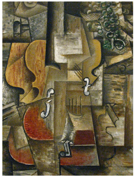
Figure 2: Pablo Picasso, "Violin and grapes", 1912.

It is never a question of only "building up" or only "building down"; all would agree on that, I expect. But I do worry about too much "building up". Dutt raised a related issue in his comments on Colander (2003) arguing that "the contributions he describes as Post Walrasian do not amount to an approach to economics but really constitute a collection of more or less interesting approaches" and that these approaches "are unlikely to coalesce to form a challenge to neoclassical orthodoxy" (p. 63)