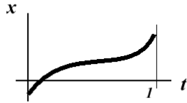
Figure 1. Example of optimal wealth distribution for a < 1 .

In part [c] the last result means that there is no optimal distribution that satisfies (3) and the despot can do no better than give all wealth to one individual.