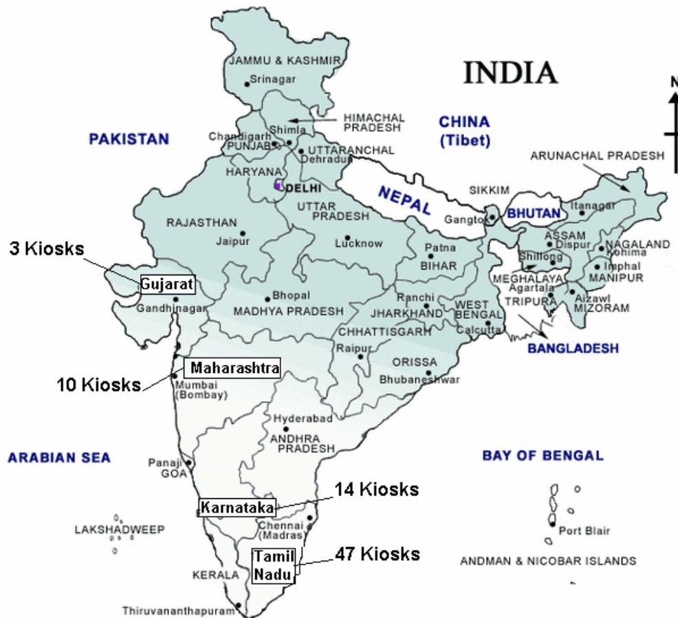
Figure 1 Location of Sample Kiosks

We have obtained six consecutive months of data on kiosk performance for 74 kiosks, covering the period April 2004 to September 2004. These kiosks were distributed across 4 states in southern and western India, as indicated in Figure 1. As illustrated in the figure, the bulk of the kiosks were in the southernmost state of Tamil Nadu. Basic economic characteristics of the four states are presented in Table 1. All four states are at least somewhat above the nationwide average in income, urbanization and literacy, and have poverty rates lower than the all-India average. Tamil Nadu stands out among the four in being the most densely populated of the four states. Of course, within each state there is considerable variation.