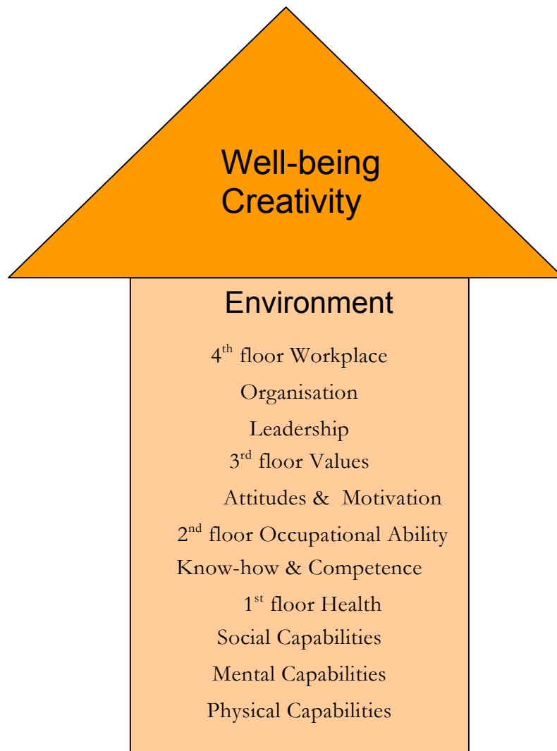
Figure 1. Work Ability House

The house has four floors, where the lowest three relate to individual resources and the top floor shows the operating environment, such as the workplace. The floors are the first floor of health, the second floor of occupational ability, the third floor of values and the fourth floor of organisation . The three crucial perspectives are