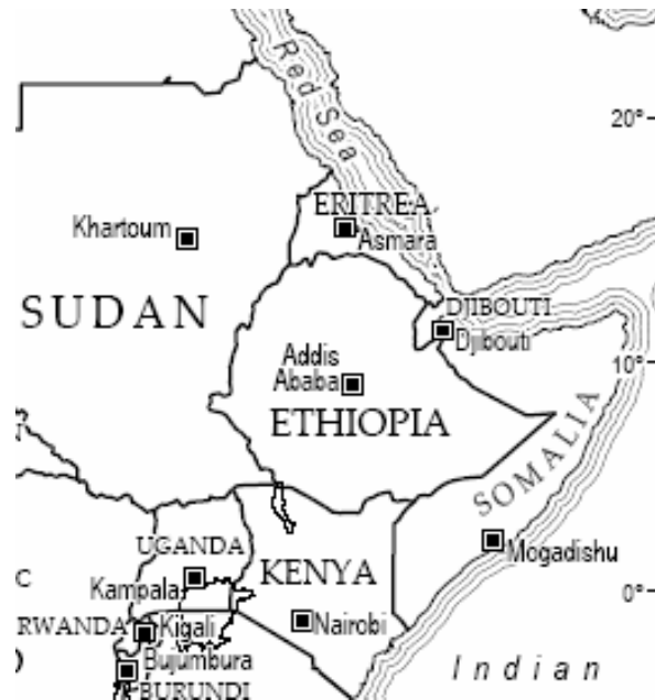
Figure 1 Horn of Africa

governments usually appreciate only the illegal dimension of cross-border trade and, when they act, their normal response is to try to control the commerce and its actors.