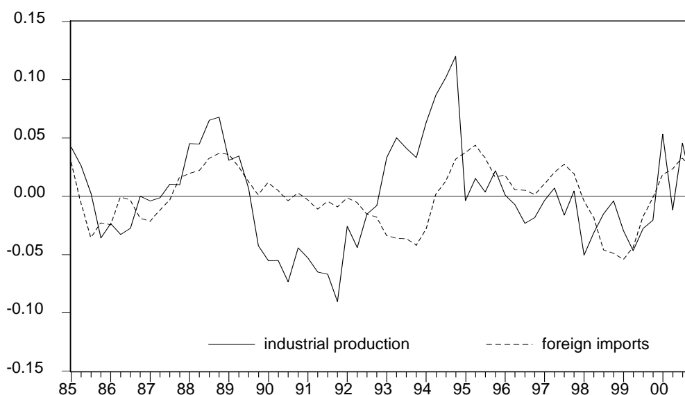
Figure 1 Cyclical components of foreign imports and domestic industrial production

developing economies where reliable price data are not available the exports/imports ratio makes a good alternative as it is invariant to the choice of price indices. It is also used to measure the US trade balance in Haynes and Stone (1982).