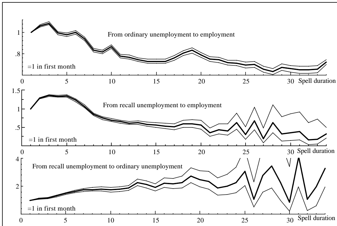
Figure 1. Estimated spell duration baseline hazard rates ( \exp(\hat{I}_{oe}) , \exp(\hat{I}_{re}) and \exp(\hat{I}_{ro}) ) with 95 per cent point-wise confidence intervals).

For temporary dismissed workers, there is positive duration dependence in the employment hazard (the hazard rises with around 30 per cent) during the first 6 months of the spell, after which there is a monotonous negative duration dependence. As expected, there is no rise around the time of benefit exhaustion, since (the few remaining) temporary dismissed workers receive their ordinary wage at this stage of the spell. The hazard for transitions to ordinary unemployment displays a very strong (and fairly monotonous) positive duration dependence. Hence, the longer a recall spell has lasted, the more likely it is that it ends in ordinary unemployment rather than in the intended recall.