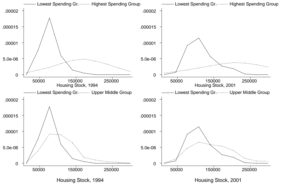
Figure 2. Distribution of Per Capita Housing Stock across Districts in the Lowest Spending Group, compared to that in the Highest Spending Group (Top Panel) and the Upper Middle Group (Bottom Panel), 1994 & 2001

Note: Districts are divided into quintiles based on spending in 1993-94. The lowest spending group corresponds to the bottom quintile, the upper middle group is the fourth quintile, and the highest spending group is the top quintile.