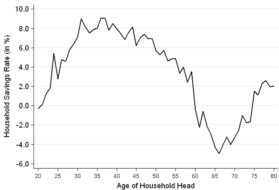
Figure 1: Age profiles of the household savings rate

Notes: Weighted by population weights. EVS data (1998, 2003, 2008).