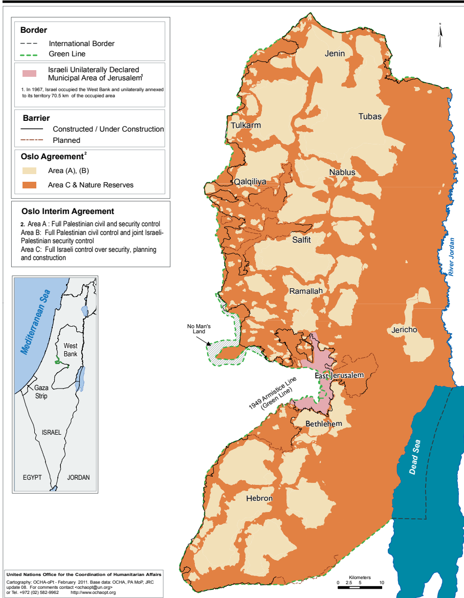
United Nations Office for the Coordination of Humanitarian Affairs, Occupied Palestinian Territory, West Bank Area C Map, February 2011.

http://www.ochaopt.org/documents/ocha_opt_area_c_map_2011_02_22.pdf , accessed 12 April 2012