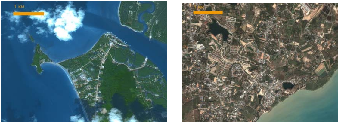
FIGURE 3. Comparison of the most developed area on Lanta Yai to Phuket at the same scale [1].

correlated with its regional transportation connections. Following the erection of a bridge connection Phuket to the mainland, development activity exploded on the island. Travel by car is now the primary form of transport on Phuket, and the island has some of the highest traffic accident rates in the country [7]. Phuket is an island of tourists and for tourists. Such intense development has forced natives to relocate due to the high cost of living and the virtual elimination of locally-owned enterprises. The precedent set by this internationally-known Thai tourist island does not bode well for Lanta, which has similar natural resources but is adamantly opposed to the nature (party-centric) and quantity of tourists that Phuket attracts. Communities on Lanta strongly wish to retain their cultural heritage, even though the dramatic increase in tourism has already begun to transform lifestyles of peoples such as the Urak Lawoi [8].