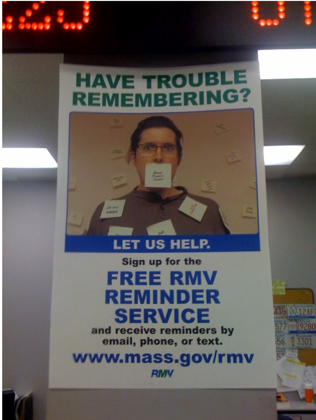
Appendix Figure 1: Free Reminder Service Offered at Boston DMV