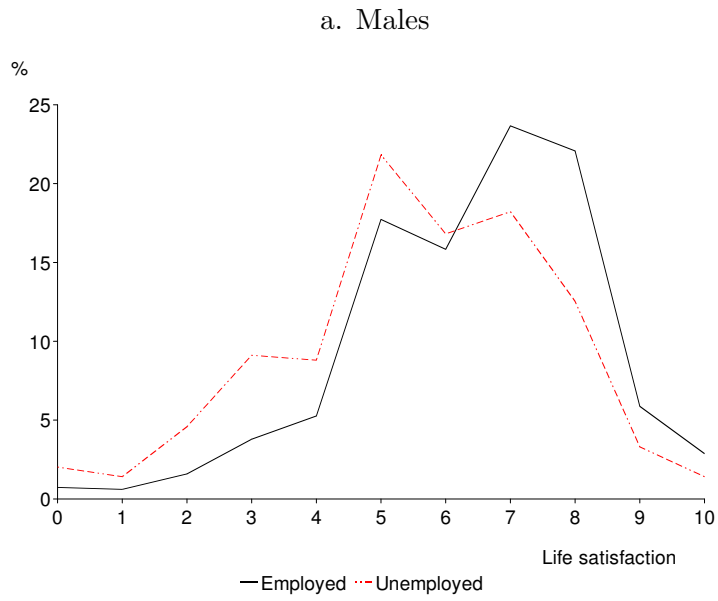
Figure 1: Distribution life satisfaction of unemployed workers; when employed and unemployed