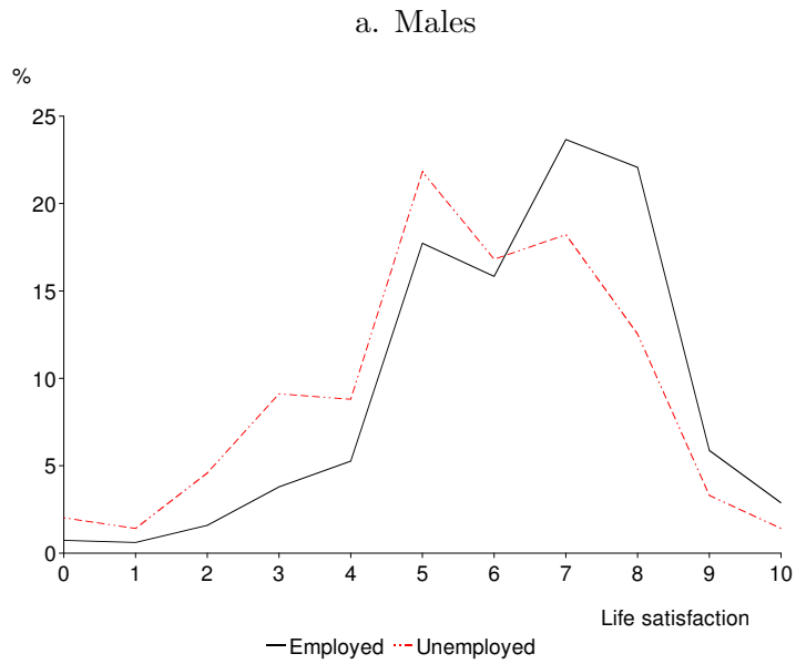
Figure 1: Distribution life satisfaction of unemployed workers; when employed and unemployed