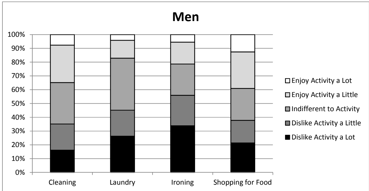
Figure 1 Preferences by Gender and Activity