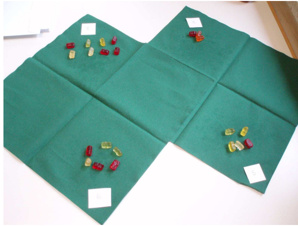
Figure 1: Experimental set-up

altruistic/non-altruistic choice, respectively, were randomized. We found no side effect (two-sample test for proportions, p = 0.775 , and p = 0.618 in treatment 1 and 2, respectively). The gummy bears were placed in a way that it was easy to capture the amount. In addition, we placed a little piece of paper with a number indicating the amount of gummy bears next to each payoff (see figure 1). Thus, the child did not face an abstract choice, but had the options directly in front of him/her.