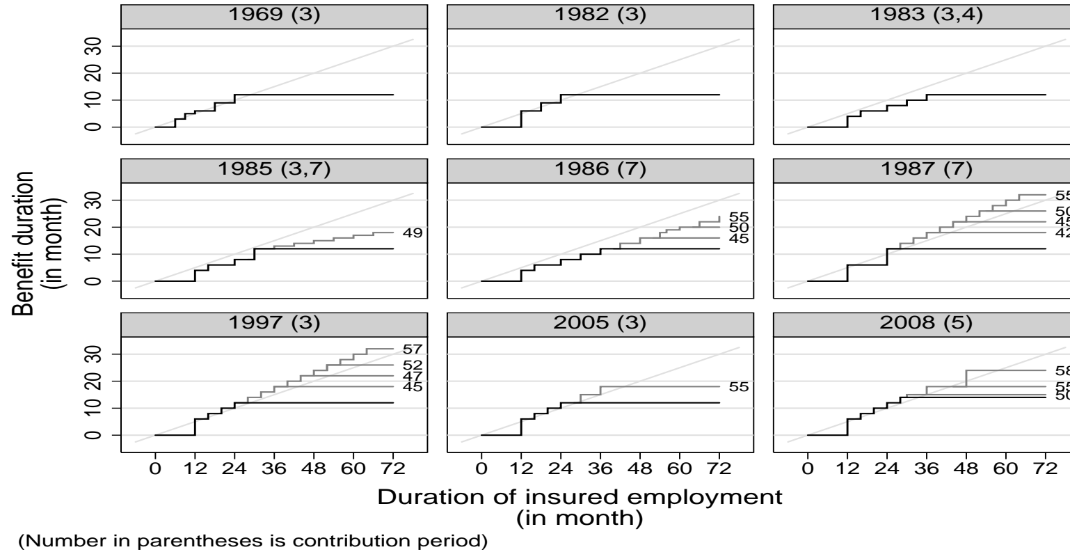
Appendix Figure 1: Changes in the Relationship of Length of Insured Employment and Duration of Benefit 1969 to 2008

Sources: Alber, 1989: 301; Boss, 2008: 50; Bundesministerium für Arbeit und Soziales (Hg.), 2008b:75; Bundesministerium für Arbeit und Sozialordnung (Hg.), 1998: 90; Cramer, 1986: 203; Schmid et al., 1987: 154; Steffen, 2008; Würz, 1999: 43.