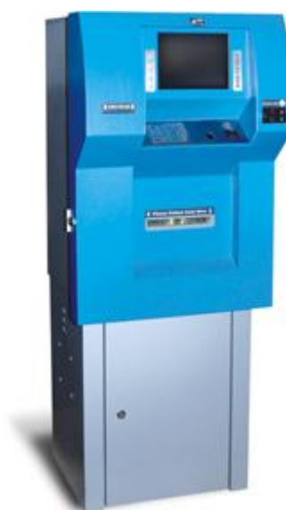
Figure 4: A Gramateller ATM