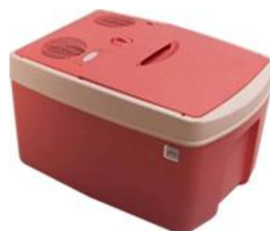
Figure 5: ChotuKool

To cut down costs, Godrej has reduced the number of product parts from 200 to 20 and eliminated the deep freezer (Singh et al. , 2011) ChotuKool employs thermoelectric cooling, which runs on a cooling chip along with a fan similar to those used to cool computers, instead of using compressors, the regular cooling method for refrigerators (Chakravarthy and