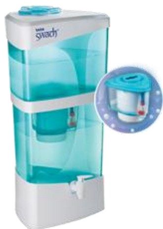
Figure 3: Tata Swach

Following closely on the heels of Tata Motors launching the world's cheapest car the Tata Nano, another Tata Group company, Tata Chemicals Ltd. (TCL) introduced the "Tata Swach" the world's cheapest household water purification system in December 2009 (Economic Times, 2009). The objective, declared in TCL's Annual Report for FY 2009-10, was "to reduce the incidence of water borne diseases by making safe drinking water accessible to all" (TCL, 2010: 9). The expression "Swach" is a variant of Hindi word "Swachchh" and means "clean". It has been developed by TCL's Innovation Centre and is based on "natural materials and cutting edge nanotechnology" (TCL, 2010: 9). While the combination of "locally sourced