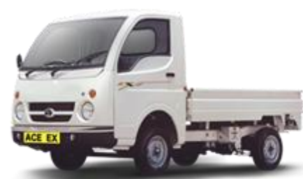
Figure 2: Tata Ace Ex

Tata Motors Limited (TML), a publically-listed company of the Tata Group and known for introducing the world's cheapest car, the "Tata Nano", has another successful frugal innovation to its credit, namely the mini truck "Tata Ace", which was launched in May 2005. The Tata Ace is a small commercial vehicle (SCV) with a payload capacity of 0.75 tons (TML, 2005). Launched for a price-tag of Rs. 225,000 (approx. $5,000) the Ace cost 50% less than any other four-wheeled commercial vehicle in India (Palepu and Srinivasan, 2008).