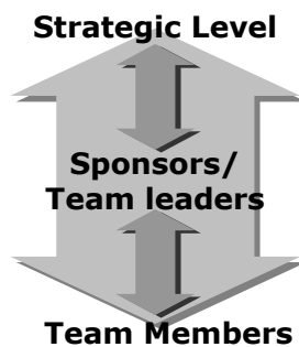
Fig. 2 Information flows freely up and down the hierarchy

A functional group's participation appears closely related to its contribution – when participation is low, contribution is low, and when participation is high, contribution is high. Describing the link between participation and task performance, a manager notes [9]: