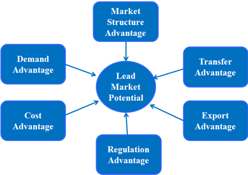
Figure 2: A model of Lead Markets based on Beise (2004) and Rennings and Smidt (2008)

The understanding of lead markets has been further refined and extended by several works of Marian Beise (cf. Beise 2001, 2004; Beise and Gemünden 2004; Beise and Rennings 2005a). Today, it is generally agreed that a lead market characterizes a country where an innovation is first widely accepted and adopted (Beise 2001; Beise and Rennings 2005b; European Commission 2007). Lead markets are thought to possess several advantages, such as “cost advantages” (e.g. factor costs), “demand advantages” (e.g. high purchasing power), as seen in Figure 2 .