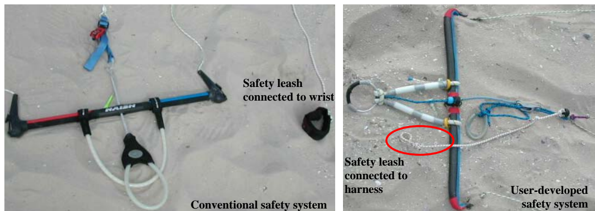
Figure 1: Comparison of safety systems

available system. The initial dissatisfaction with the commercially available products came from the dangers connected to them. When reaching a certain level of excellence the conventional safety system can become a danger. When the lines tangle the control over the kite is reduced and therefore control over the whole system can be lost. This danger can largely be reduced with the novel set-up as can be seen in Figure 1. Industry experts stated that they themselves are currently working on a very similar system. This shows that the inventing user here certainly is ahead of the market and the product they built by themselves will be introduced to the market soon.