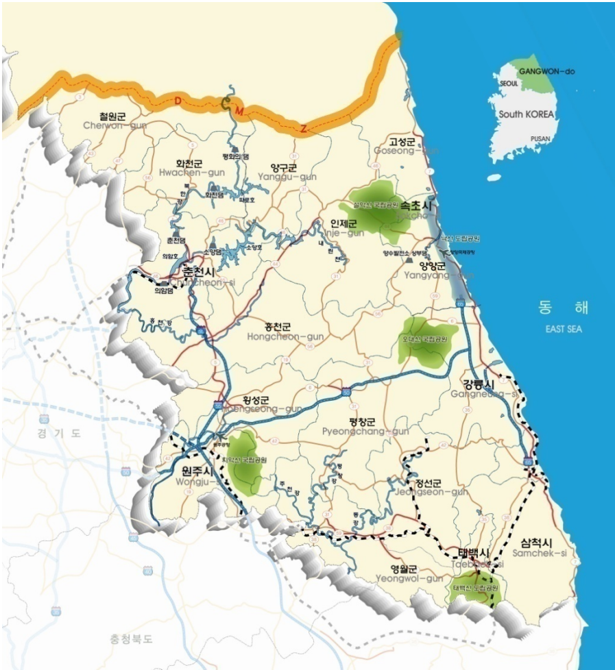
Figure 1. Map of Gangwon Province

As shown in the map below, the Gangwon province is located east of the Seoul Metropolitan Area (SMA) and bordered with North Korea along the DMZ (Demilitarized Zone). It is relatively large in physical size with 16,894Km 2 or 16% of Korea's total land area, but rather sparsely populated with only 1.52 million people or 3.1% of the nation's total population as of 2006.