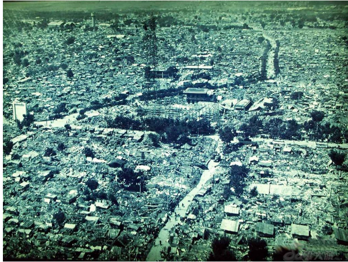
Figure 1: Tangshan shortly after the earthquake (China Earthquake Administration)