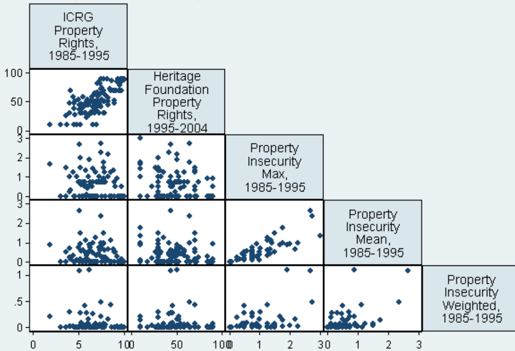
Figure 1. Scatterplot of Correlations: 1985-1995