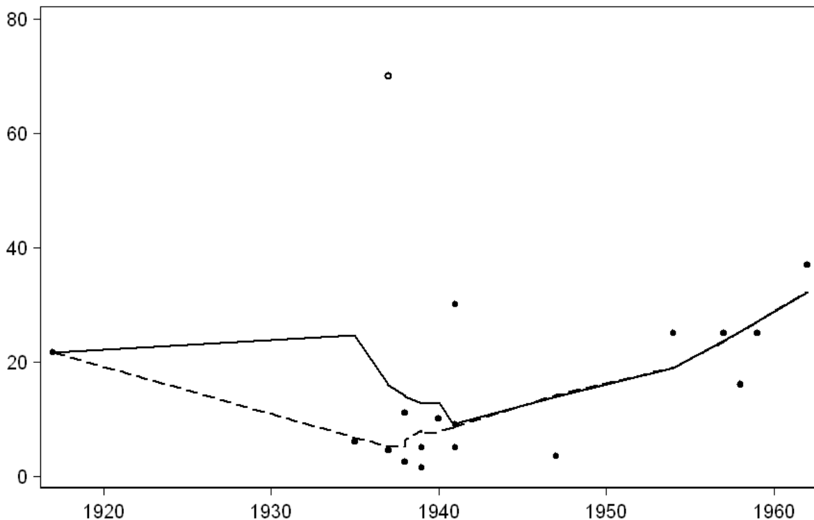
FIGURE 3. Farm prices over time

Notes: The solid line is the result of a locally weighted regression with a bandwidth of 0.8 of the sale price on the year of sale. The dotted line reports the same locally weighted regression omitting one outlier of £70.