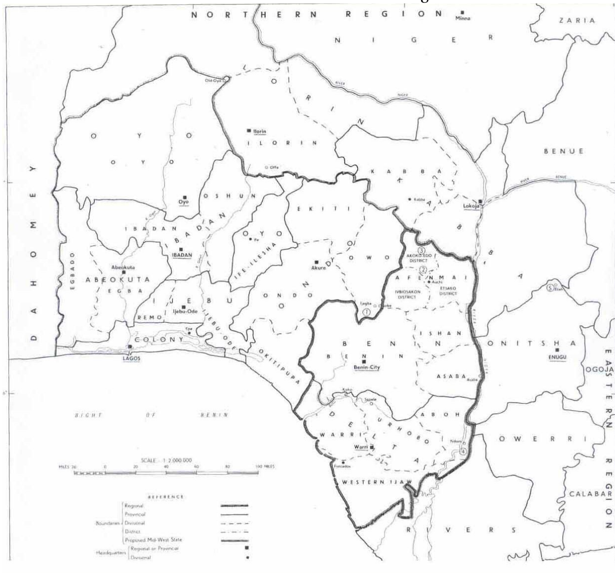
FIGURE 1. Colonial southwestern Nigeria