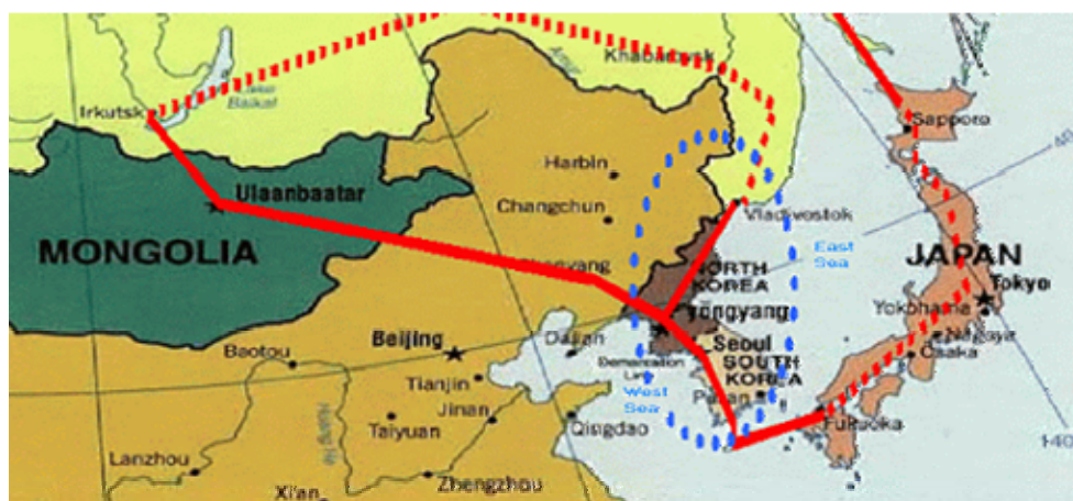
Figure 2: Alternative Routes of Power Grid Interconnection in Northeast Asia

Notes: The nomenclature is not consistent with ADBI usage