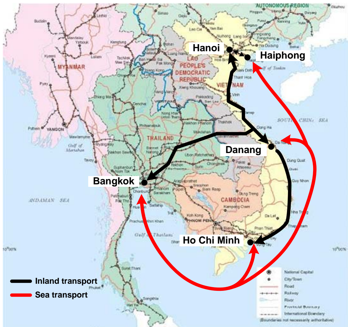
Figure 2: Supply Chain Routing Alternatives between Thailand and Viet Nam