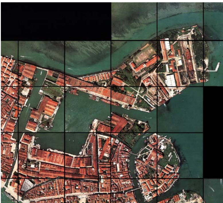
Figure 5: Aerial View of the historic Venetian Arsenal (CIRCE, 2000)

Out of the analysis of the political debate on alternative options for the re-use of the Arsenal two basic alternative directions could be extrapolated. The first one is pointing to installing “poor” functions in the ancient buildings without considering the historic significance of the area, but well compatible with the historic building structures. The functions to be introduced are small artisans activities (carpenters, electricians, masons, etc.) mostly already working within the historic centre but often under menace of expulsion because of pressings from the real estate market. The second option points to the introduction of “new” uses somehow connected to the Arsenal’s historic function, a touristic marina. On the basis of these basic assumptions two hypothetical projects or scenarios have been created in order to evaluate their sustainability.