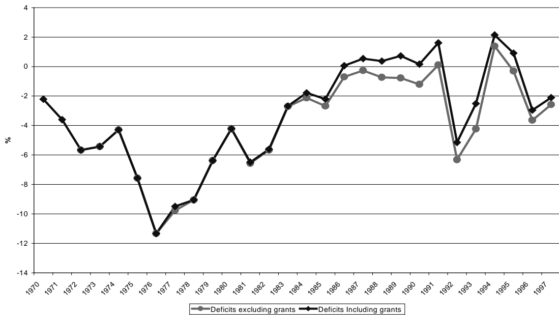
Figure 2 Plot of government budget deficits in Ghana, 1970–1997 (per cent of GDP)

hypothesis asserts that politicians follow expansionary fiscal policies in pre-election years since voters are, in the terminology of Alesina and Perotti (1995; 8-10). ‘fiscally illuded’ and don’t fully understand the implications of expansionary policies for post-election years. In the case of Ghana, however, the emphasis is on consumption spending—increases in wages and other direct cash transfers—and so the expenditure increases coincide with the election years.