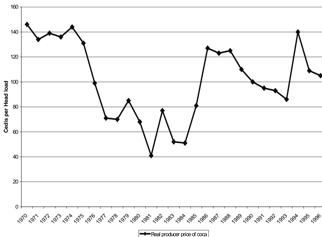
Figure 1 Plot of real producer price of cocoa in Ghana (at 1990 constant prices)

Note: * The average does not span the entire period.