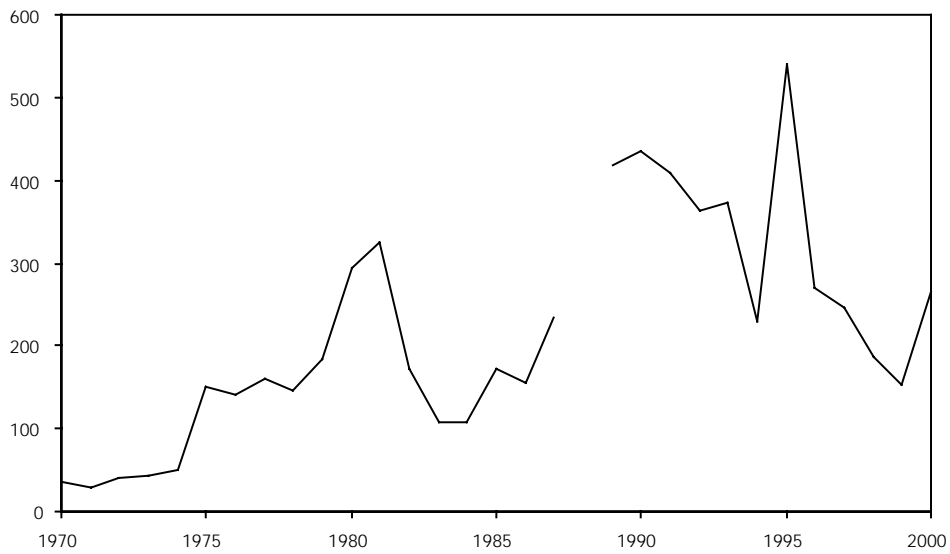
Figure 2 Annual percentage of IT consultancies exiting