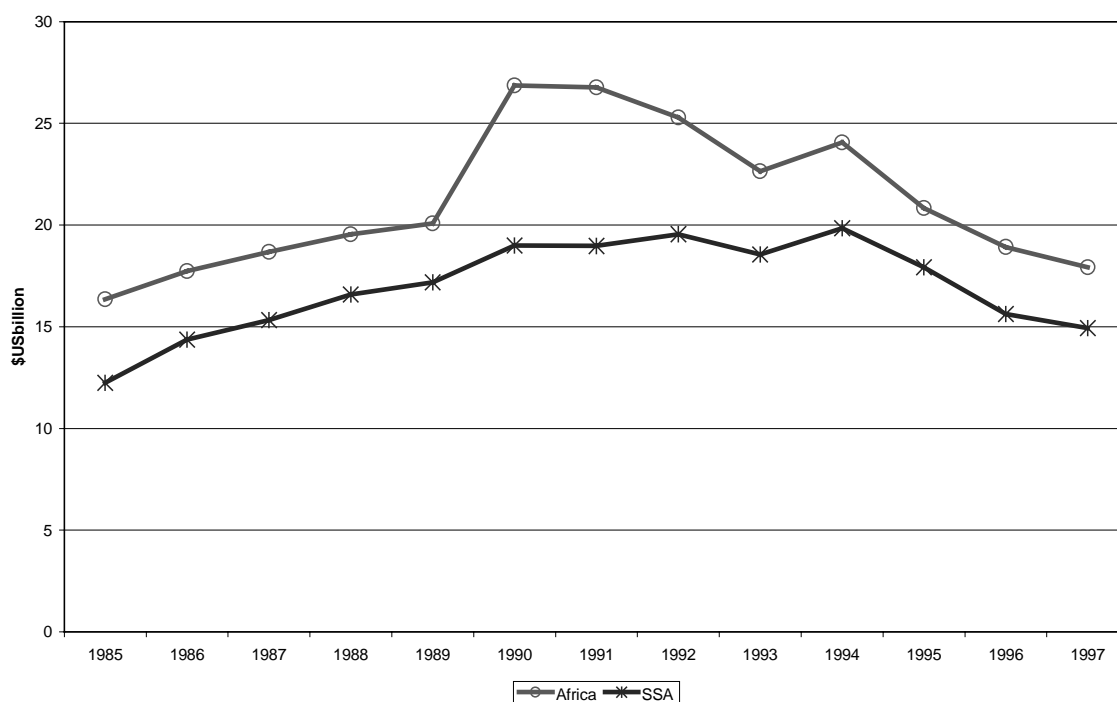
Figure 1 Net ODA disbursements for Africa region and sub-Saharan Africa at constant prices

These requirements were never fully met in East Asia, but they existed to an extent sufficient to ensure 30 years of fast growth before cronyism finally overwhelmed the system. For African states to enter this path, they would have to move beyond the partial-reform equilibrium in which many find themselves. Accordingly, we now turn to the specifics of that equilibrium as it affects state institutions.