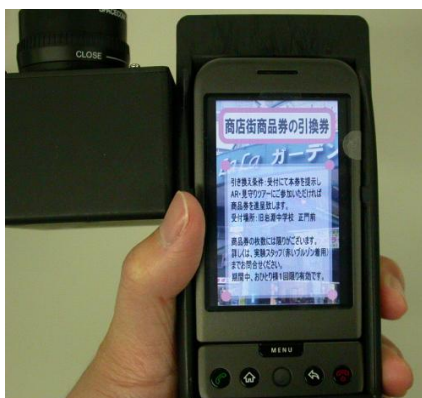
Fig .4 AR-mobile phone

The study groups investigated AR-mobile phone which can capture the image of small shopping street with photo-sensor. Then it shows the data which is transmitted by VLC from LED street light. Fig4 shows that AR-mobile phone captures both the landscape of La La garden and the text data which is transmitted by VLC.