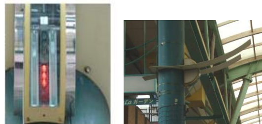
Fig.3 VLC on LED street light