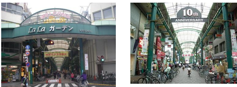
Fig1 the picture of LaLa garden Kita-ward Tokyo

The site is “La La garden”, small business shopping street located in Kita-ward Tokyo. There are approximately 72 small shops in the main street and there are 42 street lights. The length of street is about 330m and it has highest arcade in Tokyo. This site is selected because of several reasons; 1) it is typical Tokyo metropolitan landscape. 2) People in this site are interested in new technology. 3) There was a plant to replacing current HID street light to LED before the experiment was made. Therefore it is good proposal to experiment VLC.