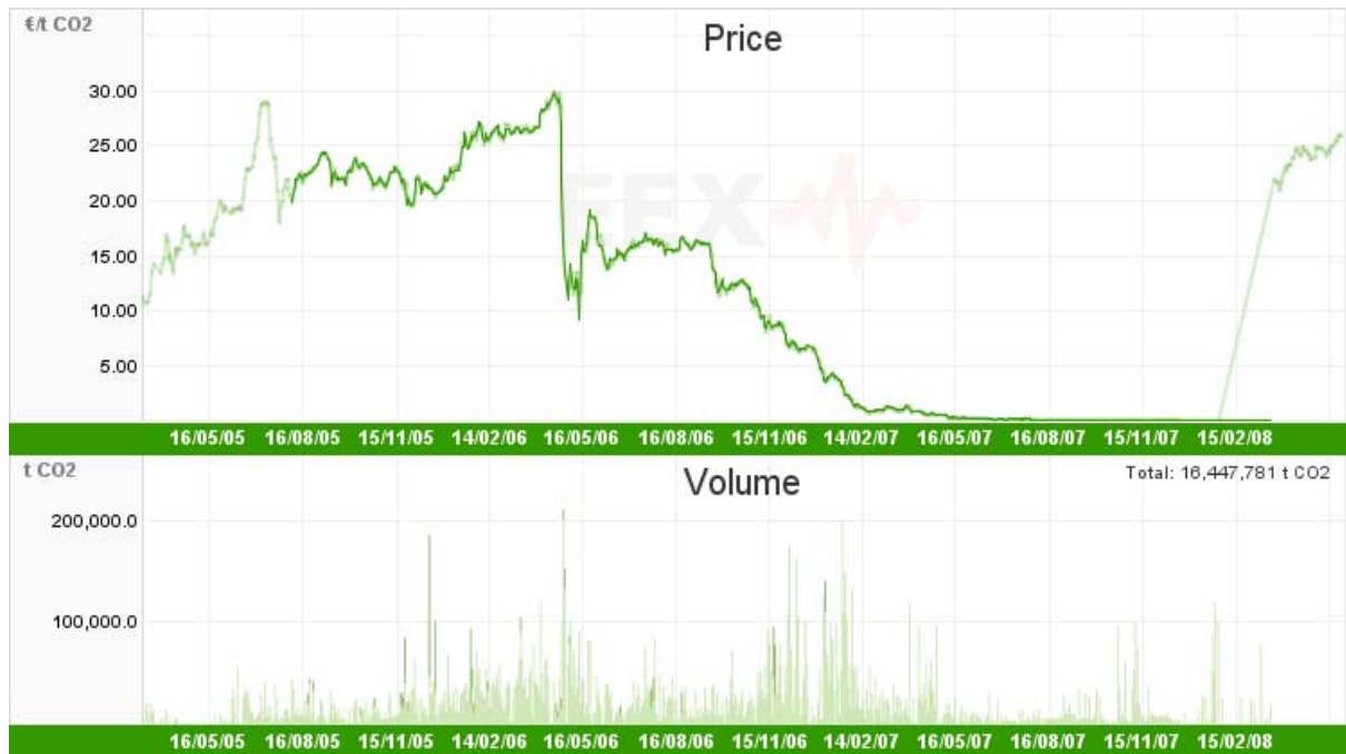
Figure 2: Spot price of carbon dioxide emission allowances in the European Trading System

One could use current market price or the average over a recent period to price carbon emissions. This measure is simple and transparent, but as the ETS is a spot market, it does not take expectations of the future into account. We will therefore need some other method for obtaining values for the seven- to ten-year term of a project evaluation.