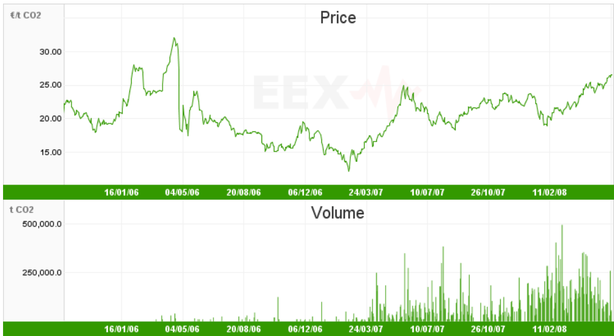
Figure 3: Derivatives price (Second Period European Carbon Futures – 2008) – from www.eex.com