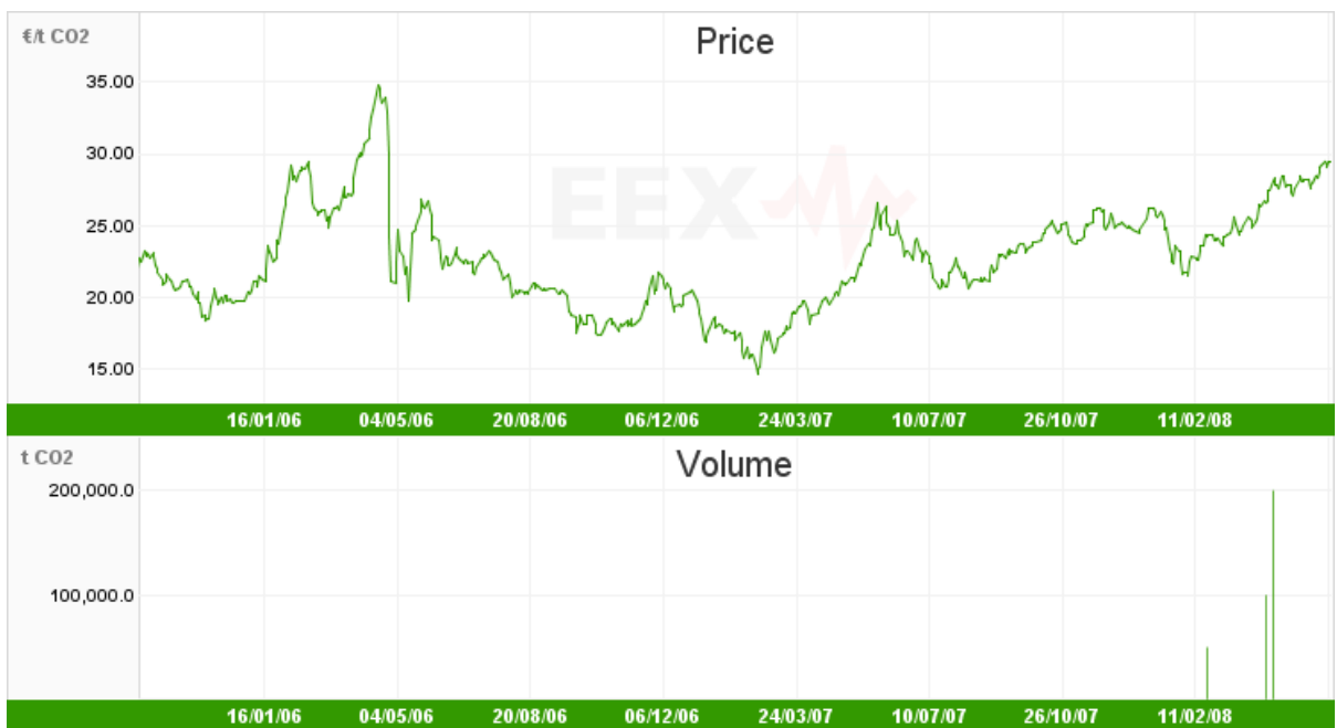
Figure 4: Derivatives price (Second Period European Carbon Futures – 2012)

Another market for carbon-based derivatives has emerged on foot of the Kyoto Protocol: a market for Certified Emissions Reductions (CERs), where each CER is equivalent to one metric tonne of CO 2 reduction.