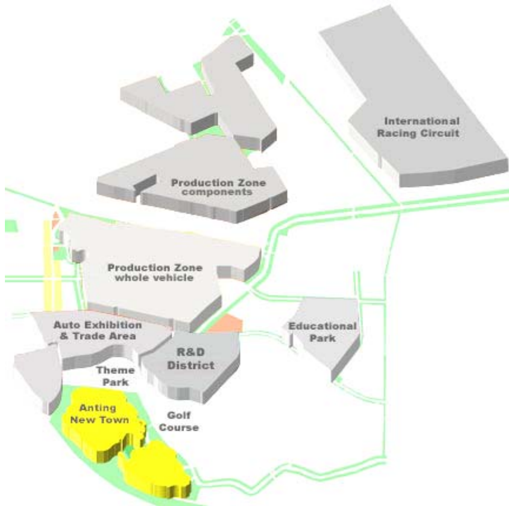
Figure 4: Layout of the Shanghai International Automobile City