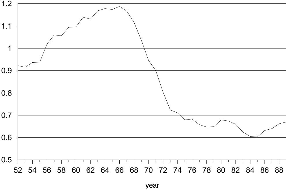
Figure 1: Net reproduction rate (NRR) 1952-1989

Source: Compiled and calculated from Statistisches Bundesamt [1994b].