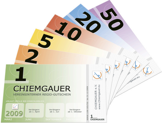
Figure 2: The Lewes Pound note, and the German Cheimgauer notes (Gelleri, 2009).