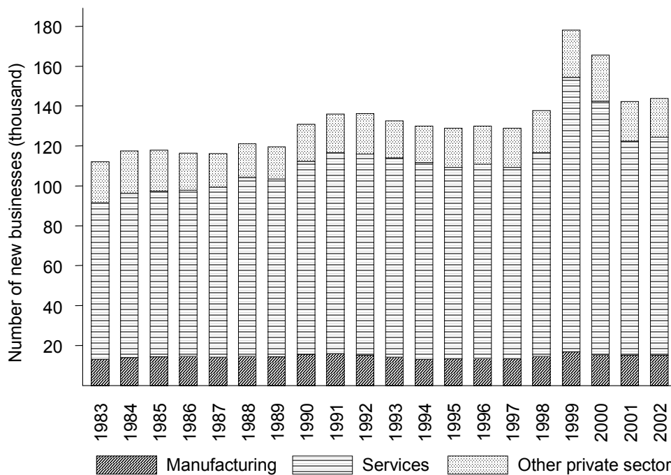
Figure 1: Number of start-ups per year in West Germany 1983-2002

about 16.6%. The majority of the new businesses, about 93,400 per year (74% of all start-ups), were in the service sector compared to about 13,800 new establishments per year (11% of all start-ups) in manufacturing. 7 There was an overall trend towards an increasing share of start-ups in the service sector and a corresponding decreasing share in manufacturing (Figure 1). In the service sector, the largest number of new establishments was set up in wholesale and resale trade, hotels and inns, and the non-specified “other” services. In manufacturing, most start-ups were in electrical engineering, furniture and food.