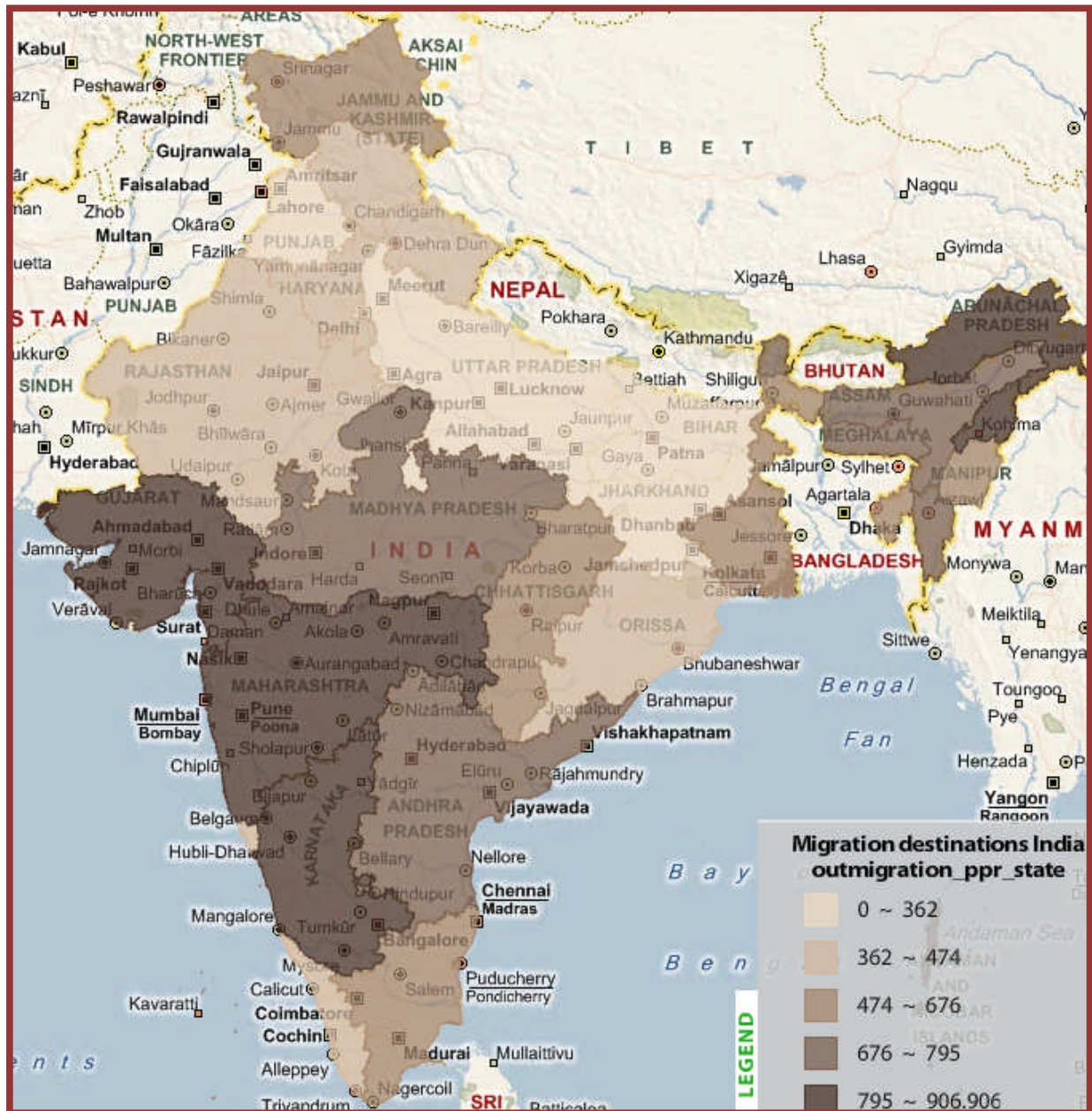
Figure A1: Intra- state migration: Distribution per 1000 out-migrants