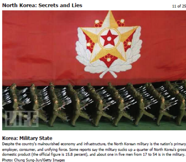
Fig. 4: North Korea’s Military

It is also a striking example of the dissemination and reinforcement of hegemonic views by an uncritical, echoing press. Photos published outside North Korea also shape the media’s cognitive apprehension of North Korea, authorising in advance what will and will not be included in its public representation. In this process, media and politics form a coherent representative complex. In international politics, to take the example of the guidelines on the EU’s foreign and security policy in East Asia, North Korea’s nuclear programme and the proliferation of related technologies are a “major threat facing the region.” This danger would also affect the EU since “threats to regional security [...] have a direct bearing on the interests of the EU” (CEU 2007: 2).