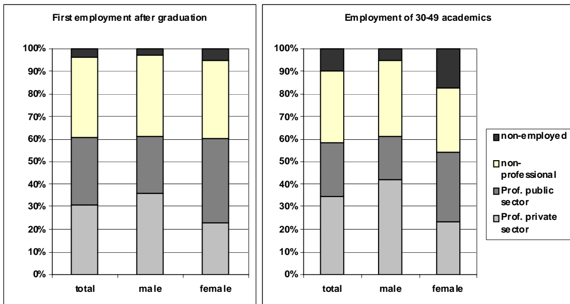
Figure 2: Type of employment after graduation and of prime age graduates, by professional sector