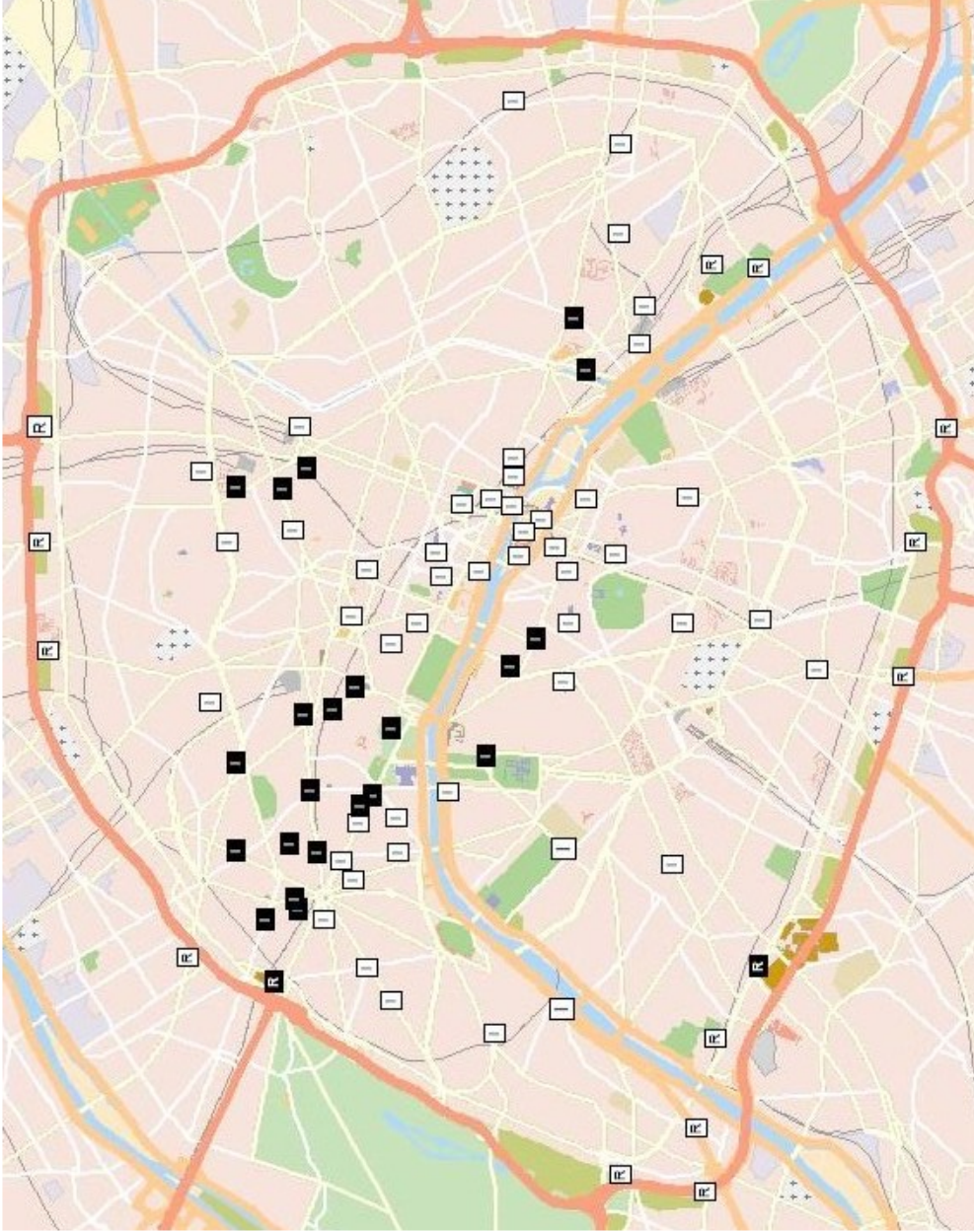
Figure 1: Black squares: Directly affected city-owned parking lots for r=900m . White squares: Other city-owned lots. The labels “T” and “R” stand for “Inner Paris” and “Ring road area” in equation (3).